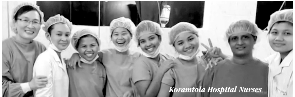
Koramtola Hospital Nurses