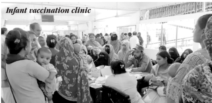
Infant vaccination clinic