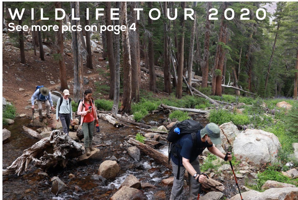
Stream crossing in Green Creeks